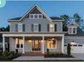
Custom Homes by Homes By Dickerson & Saussy Burbank Only fifteen homesites available.

Fifteen distinct custom homes by two award-winning builders, ready to be personalized to fit your needs. Featuring spacious homesites in a private enclave, you'll see why we saved the best for last.