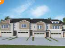
David Weekley Townhomes 1,938 – 2,141 sq. ft. 80 Deardom Way