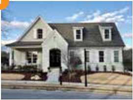
Homes By Dickerson Single-Family Homes 1,900 – 3,800+ sq. ft. 1342 Briar Chapel Pkwy