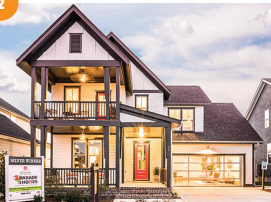
Saussy Burbank 1,500–2,200+ sq. ft. From the $250,000s 44 Cardinal Ridge Rd