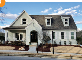
Homes By Dickerson Custom Homes 2,000–5,000+ sq. ft. From the $380,000s 1342 Briar Chapel Pkwy