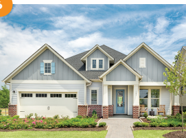
Encore by David Weekley Homes 55+ Living 1,600–3,200+ sq. ft. From the $320,000s 117 Boone St