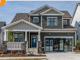
Garman Homes Fresh Paint by Garman Homes 1,500–2,600+ sq. ft. From the $240,000s 32 Cardinal Ridge Rd