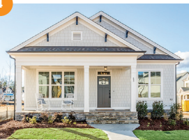
Homes By Dickerson Custom Homes 2,000–5,000+ sq. ft. From the $380,000s 53 Pineland St