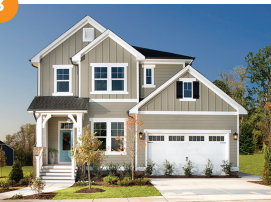
David Weekley Homes 1,900–3,800+ sq. ft. From the $310,000s 50 Cardinal Ridge Rd